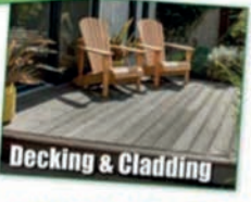
Decking & Cladding