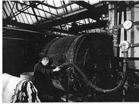
A DYE VAT AT COURT DE WYCK TANNERY